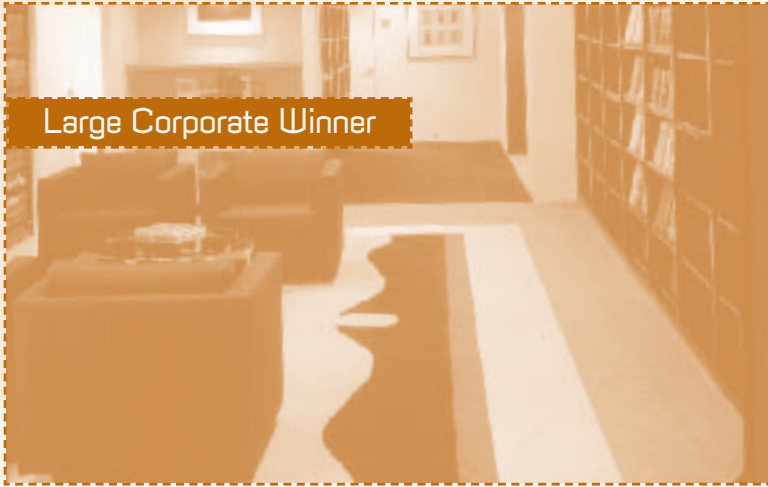
Large Corporate Winner