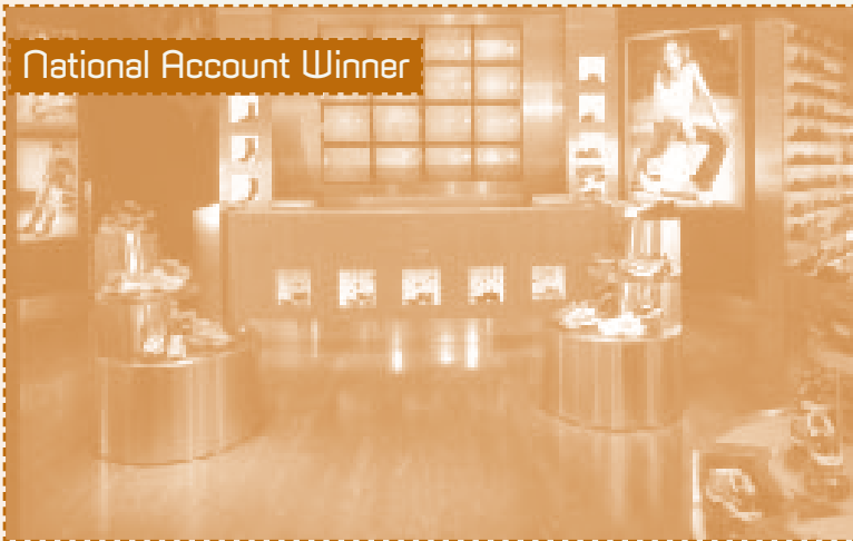
National Account Winner