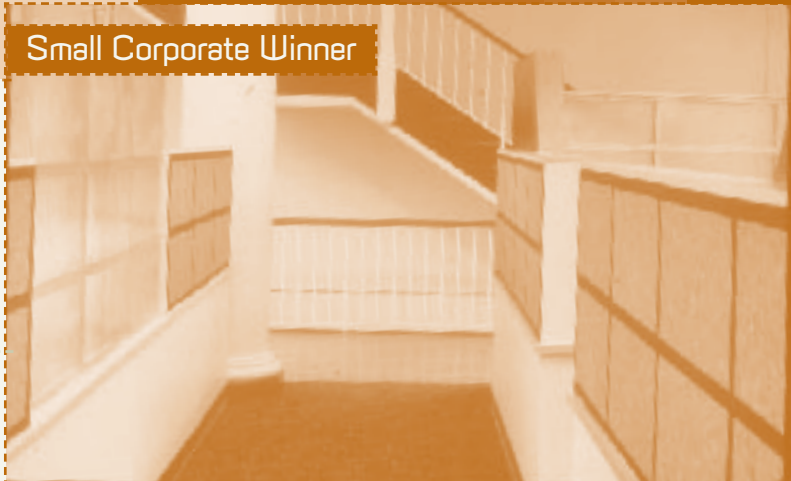
Small Corporate Winner