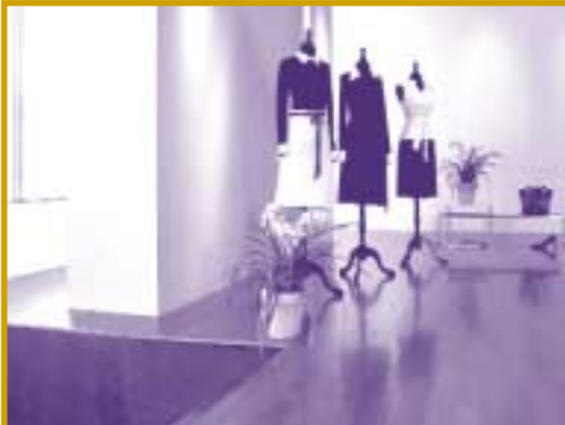
Hardwood's rich look and feel complements high-end retail interiors.

A qualified, professional contractor, such as your StarNet member, should manage the installation to protect your hardwood investment. They will ensure that the manufacturer's recommended materials and methods are used for a quality installation and for full warranty coverage. Planks and parquet tiles can be glued or nailed to the subfloor.