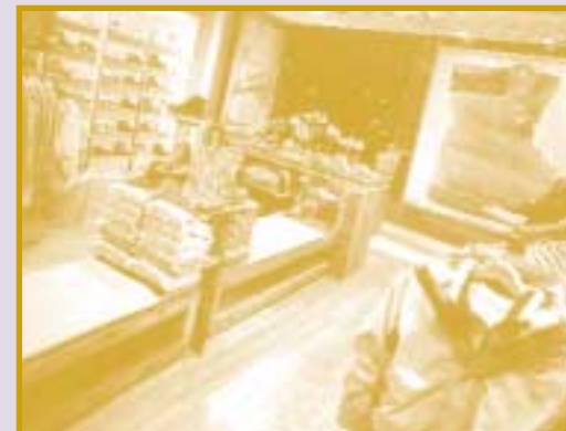
Beautiful, durable bamboo flooring is an environmentally responsible choice for commercial interiors.

Like other hardwood, bamboo options include solid strips and engineered floor that feature a bamboo wear layer over a core and backing material. The engineered products withstand moisture and can be installed below grade. Sweeping or vacuuming plus damp (not wet) mopping with an approved floor cleaner maintain bamboo floors beautifully.