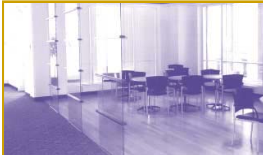
Combining wood or laminate with other floor finishes creates separation in interiors that offer an appealing mix of textures, colors and patterns.

Specifiers and facility managers can specify wood and wood look flooring with confidence. These next-generation natural and manufactured products fuse beauty with technology for floors that satisfy all criteria— aesthetics, performance, easy installation and easy maintenance. When used in full field installations, wood and laminate floors bring warmth and elegance to commercial interiors. When used in combination with other hard and soft