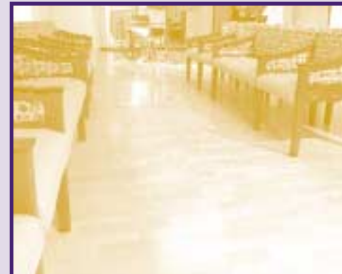
Laminate features the benefits of wood design plus superior durability and easy maintenance.

Laminates install via glue and glueless methods. Both methods produce floating structures that are recommended for installation on any grade level, even high-moisture concrete. Your StarNet member can recommend the right product and installation method to meet your needs.