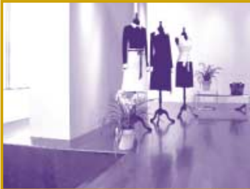
Hardwood's rich look and feel complements high-end retail interiors.

A qualified, professional contractor, such as your StarNet member, should manage the installation to protect your hardwood investment. They will ensure that the manufacturer's recommended materials and methods are used for a quality installation and for full warranty coverage. Planks and parquet tiles can be glued or nailed to the subfloor.